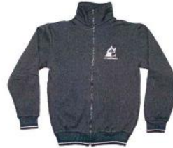
Cannington CC Zip Fleece Jacket