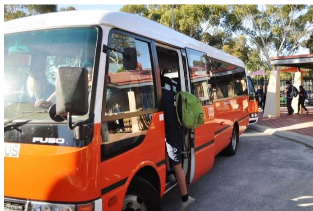
School Bus Services