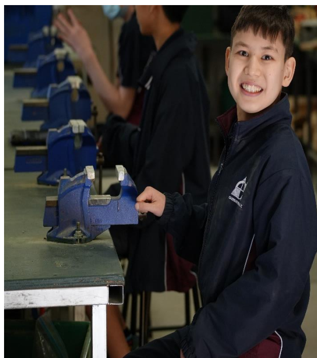
Students enjoying D&T