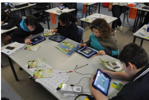
ASDAN with iPads