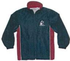
Cannington CC Zip Micro Fibre Jacket

Uniforms can only be purchased from Uniform Concepts, Willetton