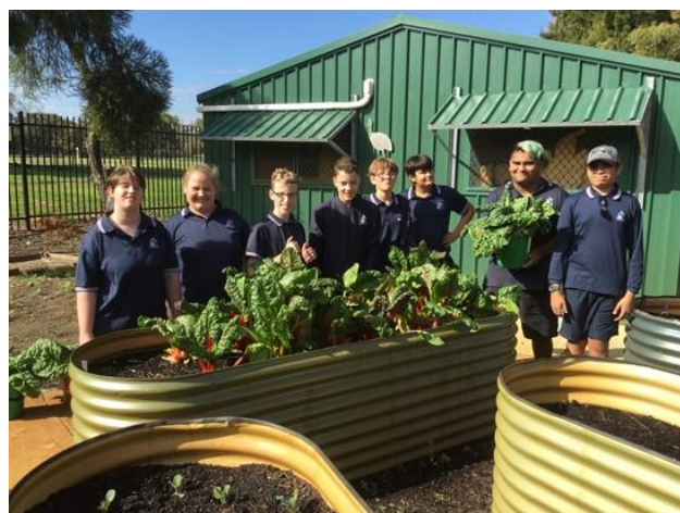
Showing off our garden produce