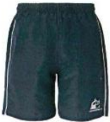
Micro Fibre Shorts