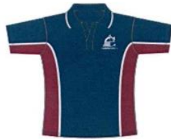
Cannington CC Short Sleeve Polo