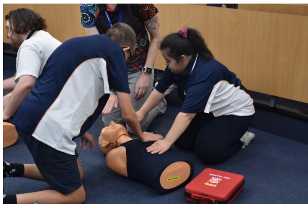
First Aid Incursion