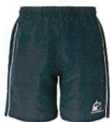
Micro Fibre Shorts