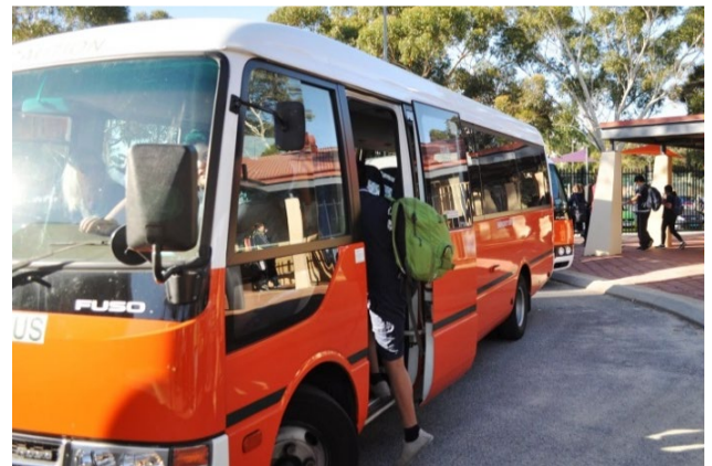
School Bus Services