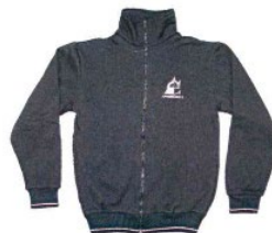
Cannington CC Zip Fleece Jacket