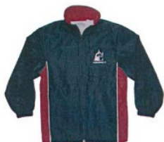
Cannington CC Zip Micro Fibre Jacket

Uniforms can only be purchased from Uniform Concepts, Willetton