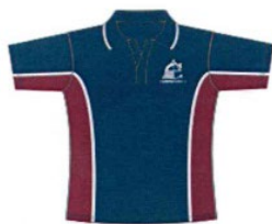
Cannington CC Short Sleeve Polo