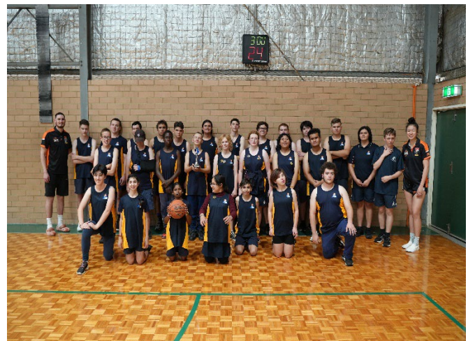
Kalability Basketball Team

A USI is free and easy to create using a birth certificate and/or Medicare card as identification and can be obtained from the USI registry or online at http://www.usi.gov.au