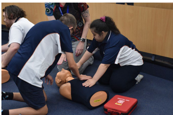
Seniors St John First Aid Incursion