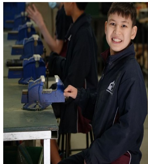
Students enjoying D&T