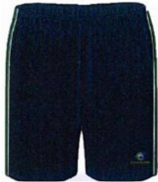
MICRO FIBRE SHORTS