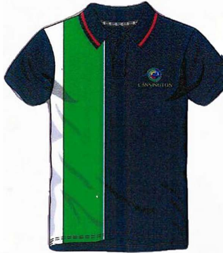
CANNINGTON CC SHORT SLEEVE POLO