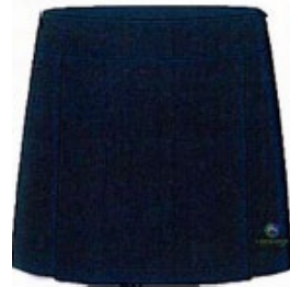
SKIRT WITH INBUILT SHORTS