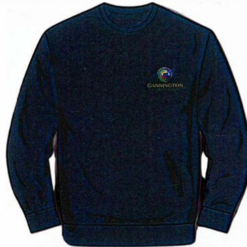
JUMPER CREW NECK